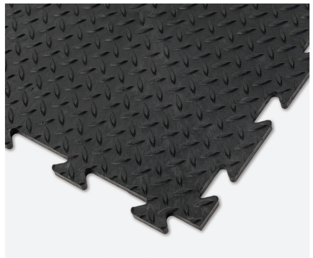
Black in stock, other colours available on request. Bevels available in both black and yellow