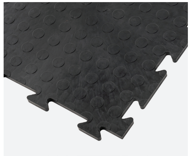
Black in stock, other colours available on request. Bevels available in both black and yellow